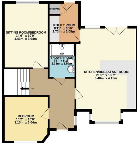
GROUND FLOOR 745 sq.ft. (69.2 sq.m.) approx.